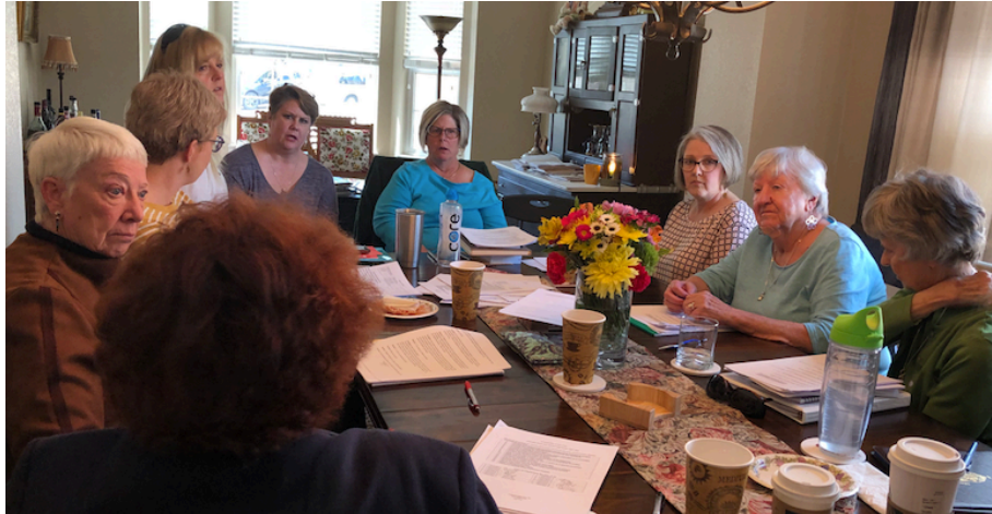
Working through Robert's Rules of Order.